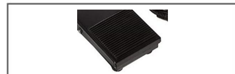
Pedal foot for handsless operation