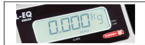
Easy weight visibility