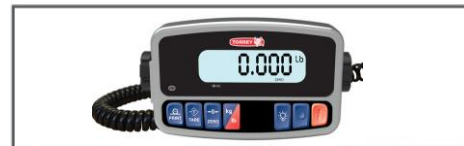
Remote indicator module