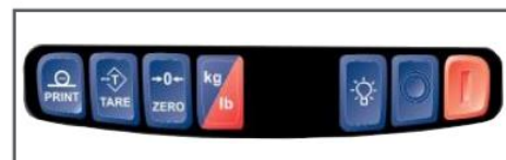
Toggles between kg and lb