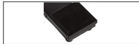
Foot pedal for handsless operation